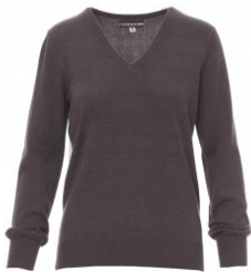
MELANGE ASH GREY 13023

COMPOSITION: 50% COTTON 50% ACRYLIC APPEARANCE: 50% COTTON 50% ACRYLIC WEIGHT: 280 GR/MQ SIZES: S-M-L-XL-XXL PACK: 1/30 HS CODE: 61103099 MADE IN: BD